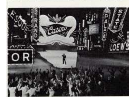
Stills from David and Lisa, The Bicycle Thief, and Singin' in the Rain. In the first Community Film Program to be sponsored by the Council, both secondary school students and the adults saw these three films. Other films included in the first series were Ballad of a Soldier and I'm All Right, Jack.

school today he has spent some 10,000 hours in the classroom but in the same period has seen more than 500 films and spent 15,000 hours watching television—watching in an untrained, undiscriminating way. In particular, the student film series is aimed at helping him to an informed evaluation of what he sees. In addition, a student's involvement in animated class discussion evoked by film showings and the second sight probing of his experience of a film is also likely to have a beneficial effect on participation elsewhere in the curriculum.