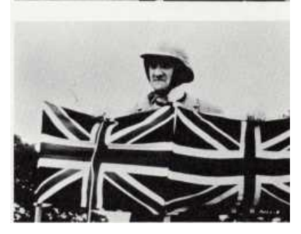
The first Community Film Program incorporated a number of distinguished shorts in addition to feature films. Stills above are from Mosaic and The Running, Jumping, and Standing Still Film. Other shorts that were shown in the series were Two Men and a Wardrobe, Day of the Painter, and The Critic.

and 80 minutes in length. An admission charge of 150 per film can be paid by either the student or the school district. Discussion guides are supplied for all films in the series to help teachers in conducting classes the day after the showing.