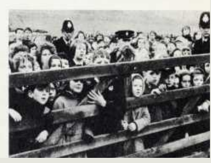
Elementary school children saw nine films in the first Community Film Program. Stills above are from (left column) The Shepherd, Romance of Transportation, Skinny and Fatty. and (right column) The Captain, White Mane, and Whistle Down the Wind. Other films in the children's series were Lines Vertical and Lines Horizontal.