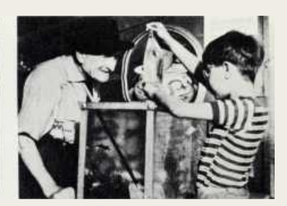
Questions towards a study of The Golden Fish

Prepared for the New York State Council on the Arts Film Project, 1966-67