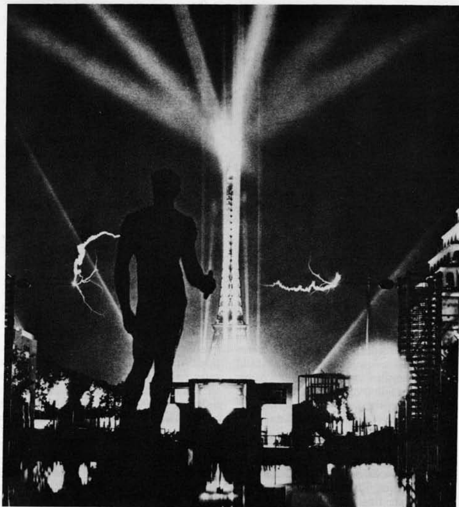
Fig. 1 "Illumination-as-Nostalgia": Paris, "the city of light" (light spectacle of 1937), from Electra catalogue, p. 136.

With a sense of the kind of work selected for Electra , we can now go back and travel along Popper's modernist summation of art movements and relate them to video, filling in the curator's numerous ellipses. In the period from 1900 to 1984, Popper situates three tendencies of electricity in art: iconographic usages (depicting the light bulb or imaging of light but not employing electrical light itself); "energetic" usages (machine art, kineticism); and, finally, the invention of tools able to communicate, diffuse, or generate information and images. Each tendency has a unique history, and there are, of course, moments of cross-pollination and parallel development. What is important here is how varying electrical uses point in some way to the need or desire for the video medium, which incorporates light, electricity, movement, the potential for