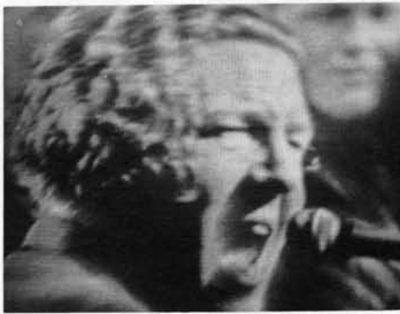
Fig. 1 Jerry Lee Lewis, still from Dan Graham, Rock My Religion , 1983.

ter is by no means necessarily a definitive change in Graham's work, it certainly indicates a drastic shift of concerns.