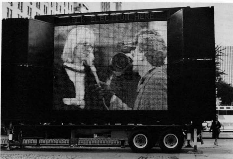
Fig. 5 Jenny Holzer, Open Mike, at Sign on a Truck , 1984.

It would be naïve, however, to assume that the ambivalence of Holzer's installation work was only the logical outcome of her commitment to the notion of a popular spontaneity, the notion of a populace that essentially knows what is