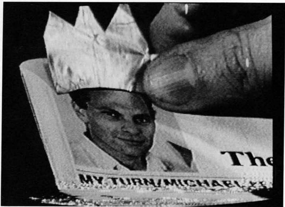
Fig. 8 Martha Rosler, still from A Simple Case for Torture , 1983.

Employing strategies of defamiliarization that are very effective in confronting the viewers with the necessity of reconstructing consciousness and of understanding political reality for themselves at every given moment, Rosler demonstrates that it cannot be the videotape's function to operate as a one-time aesthetical substitute for the continuous labor of representation-construction. Layers of information (such as simultaneous voice-over, character-generated rolling textual information,