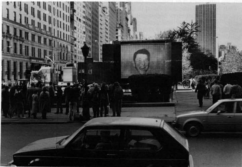
Fig. 6 Vito Acconci's contribution to Jenny Holzer's Sign on a Truck , 1984.

right and what is wrong if it is only given the proper means of direct self-expression. This anarchistic trust in the collective mind as being innately democratic, concerned with its environment and social equality and justice, has long become a myth that itself functions to protect us from insight into the actual operations to which the collective mind is subjected. An overwhelming number of the people who were interviewed by Holzer during the open-mike sessions, as well as during the interviews that she and other participants conducted in the street before the installation of Sign on a Truck , turned out to be fervent supporters of Ronald Reagan. Thus some messages emanating from the sign could be perceived as part of a pro-Reagan cam-