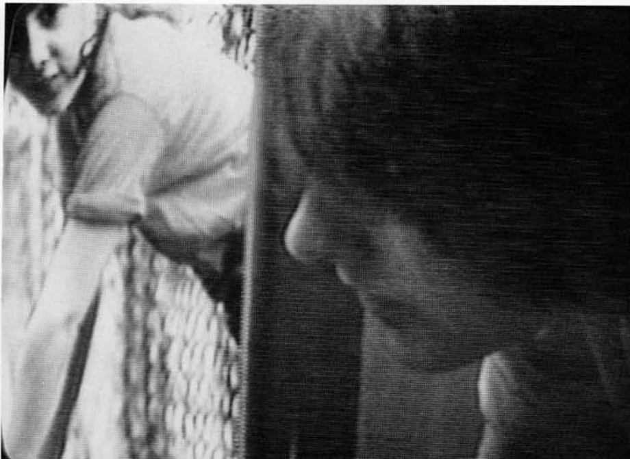
Fig. 4 Dara Birnbaum, Damnation of Faust: Evocation , 1983, still from videotape.

In her most recent videotape, however, Birnbaum has taken an utterly different approach, one that may make us even reconsider our assumptions about her earlier work. The Damnation of Faust: Evocation (1983) (Fig. 4) seems to have originated in the desire to distance herself from a premature identification of her practice as one of appropriation of pirated TV imagery and a reduction of her work to the seemingly one-dimensional critical engagement with television. It seems to have been further motivated by the desire to turn her back on the questioning of avant-garde's relationship to mass culture and seems to argue for a renewed exclusive attachment of contemporary artistic