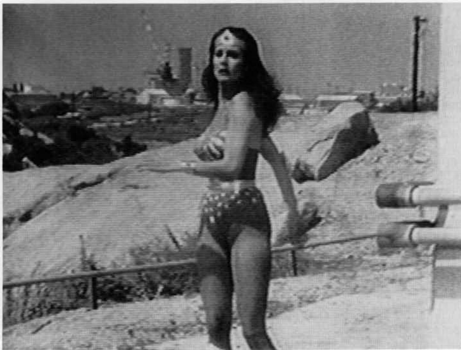
Fig. 3 Dara Birnbaum, Technology/Transformation: Wonder Woman , 1978, still from videotape.

It is clear that the tape Rock My Religion fits neither the program of the