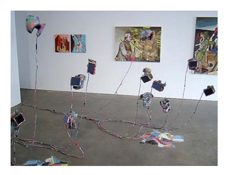
LoVid VideoWear, 2003

Dusted: There seems to be a decisively empirical approach to LoVid's work. The pieces often seem to be about coming up with variants and permutations of specific themes. I was hoping you could talk a little bit about both how you formulate a theme, and then about the appeal and procedures of creating variations.